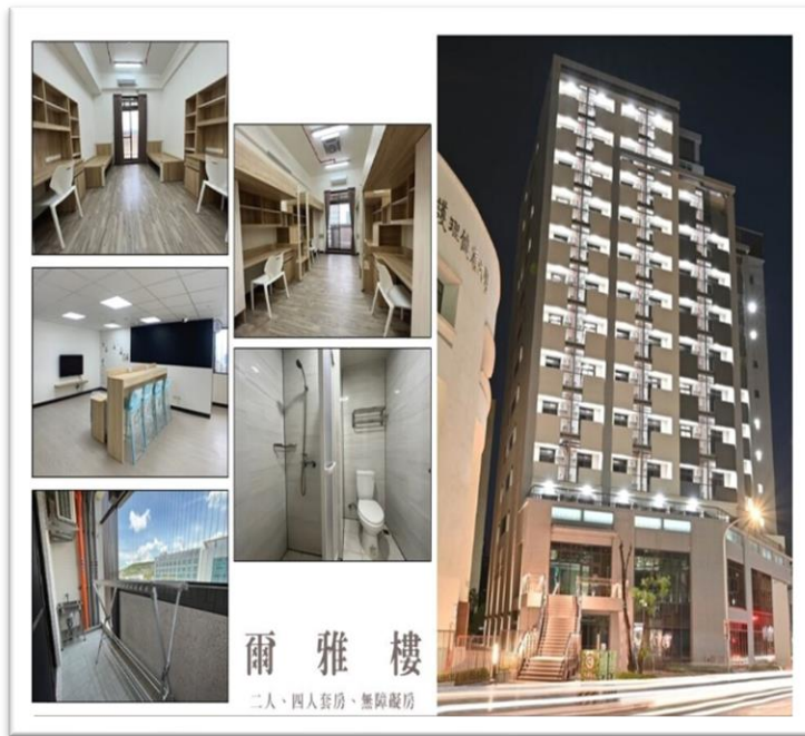
Exterior of the building