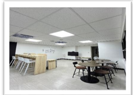
Kitchen & lobby