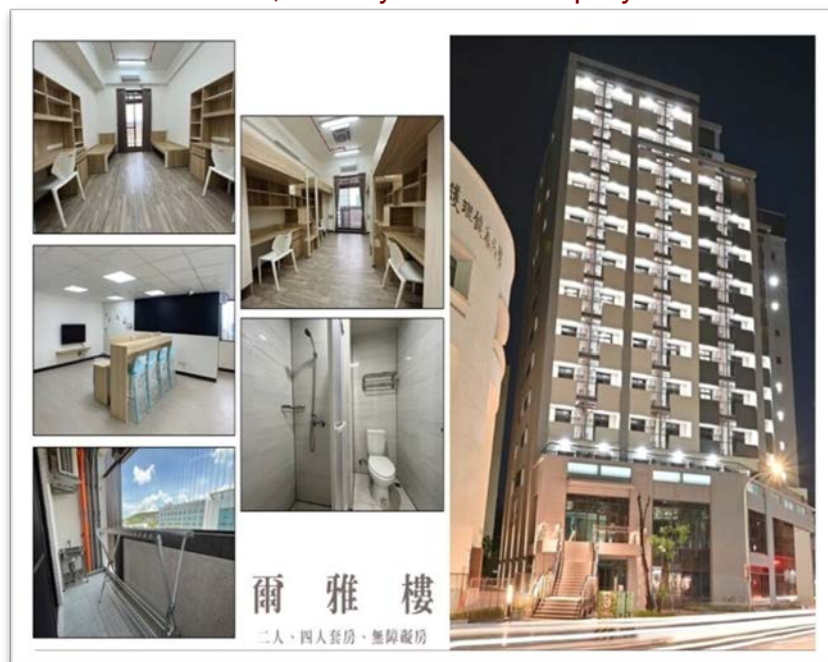
Exterior of the building