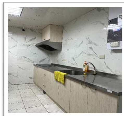
Kitchen & lobby