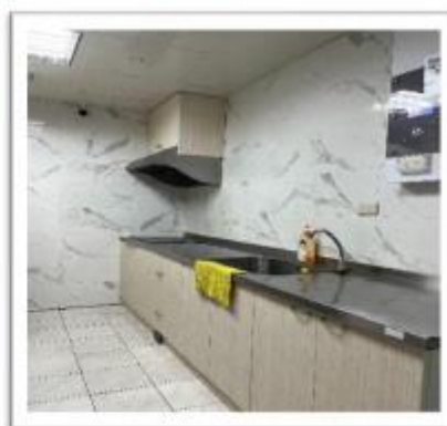
Kitchen & lobby