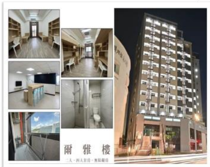
Exterior of the building